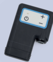
Tech Pack housed in built-in pocket